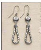
Finishing touches: (pictured above clockwise) freshwater pearl lariat, bamboo coral and bead necklace, silver earrings (all from Pia)