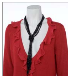
Long necklaces: (pictured left to right) black beads (M&S), discs (Oxfam), glass beads (M&S)