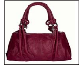
Bags galore: (pictured clockwise) Oushka 'Jerry'; Mogil 'Flamingo'; Neesh 'Chi Chi'; KV Patent Tote (all from Red Direct). Tranquillity and Metropolitan Life, (both from Pia)